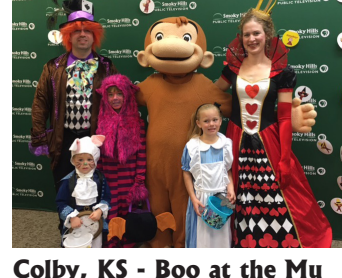
Colby, KS - Boo at the Mu