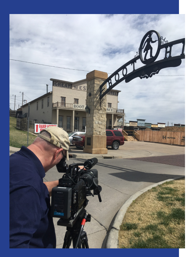
Dodge City, KS - One of the many communities we covered in Season 6 of Traveling Kansas !

Smoky Hills PBS provides Central and Western Kansas with commercial-free, high-quality programming that nourishes curiousity, enriches people's lives, and makes Kansas a better place to live and work.