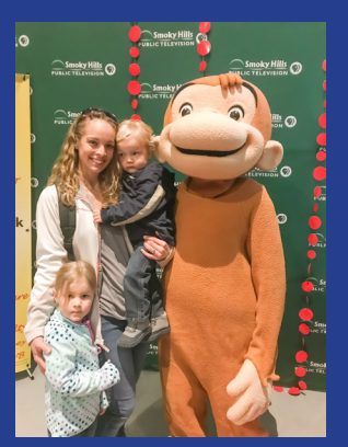
Russell - Dream Theater