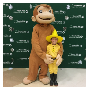
Salina, KS - Mayor's Christmas Party