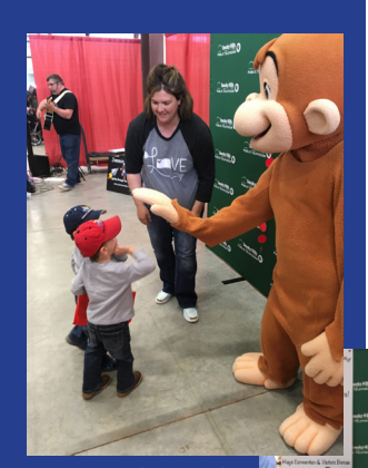
Dodge City - 3i Show